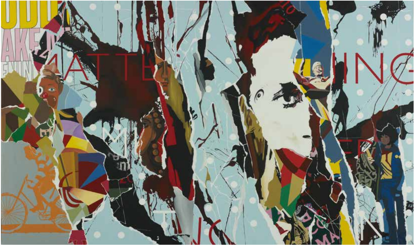
Untitled W=268 H= 160 cm Acrylic on canvas