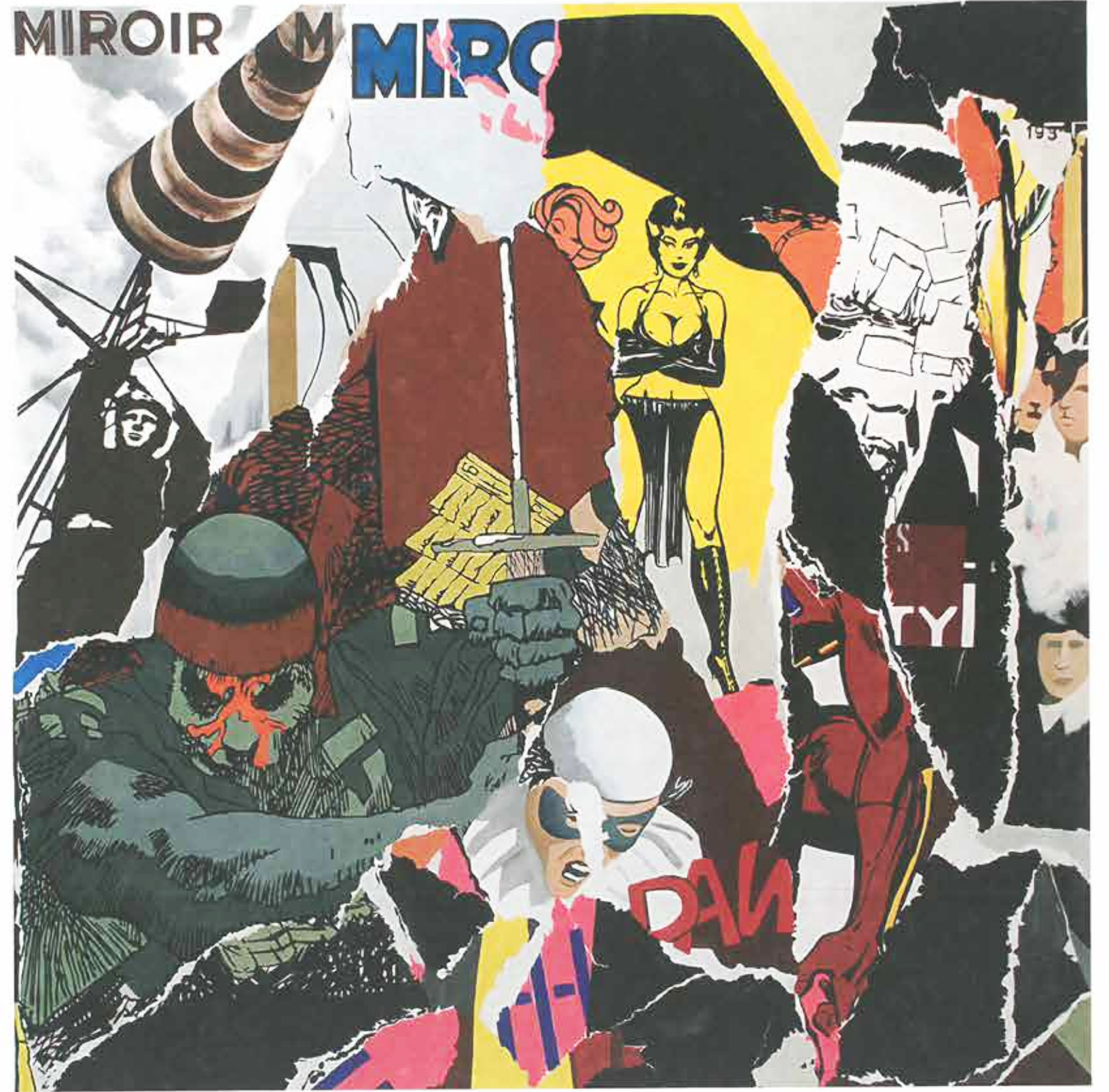
MIRROR OVER SIN CITY (III), Acrylic on Canvas , 138 x 138 cm