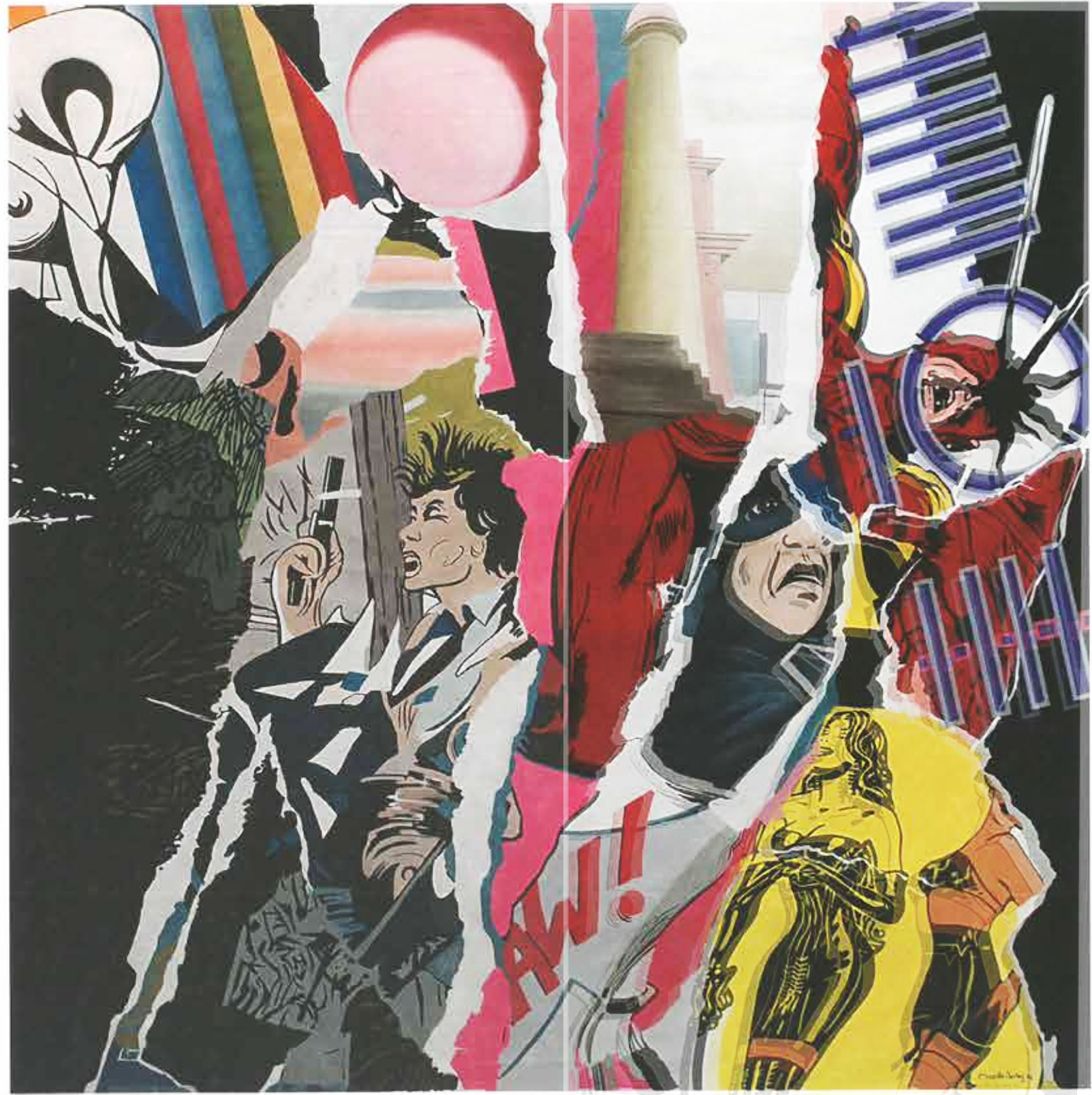
MIRROR OVER SIN CITY (II), Acrylic on Canvas, 138 x 138 cm