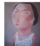
Youssef Youssef, Untitled, Acrylic on canvas, 15x180 cm, 2017