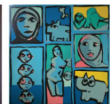
Jean-Marc Nahas, Miami 1, Acrylic on wood, 130x120 cm, 2018