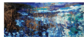
Hussein Baalbaki, Stormy Day, Mixed Media on Canvas, 150x300 cm, 2019